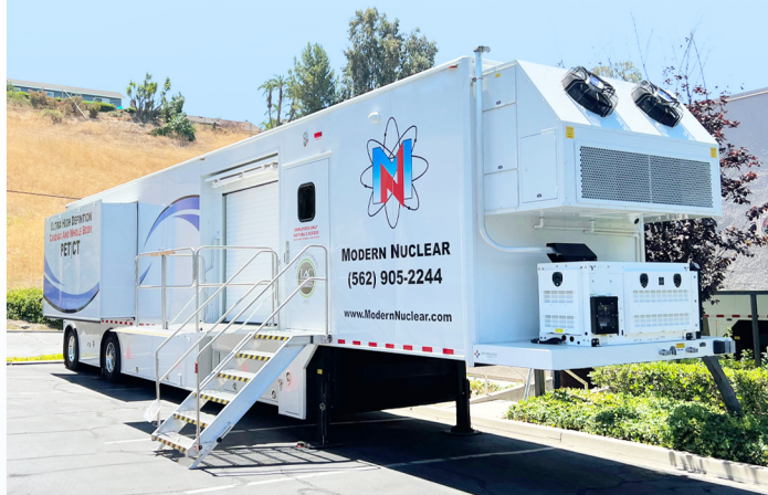
medical trailer with PET/CT scanner inside

During the stress phase of the exam, you will be injected with a pharmaceutical* that will make your heart respond as if you were exercising .