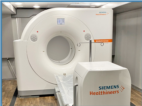
PET/CT scanner used for cardiac scanning

The results of this scan will help your doctor determine if you should have follow-up treatment. If you are already being treated for a heart-related condition, the results of this exam can also be used to help your doctor manage your treatment.